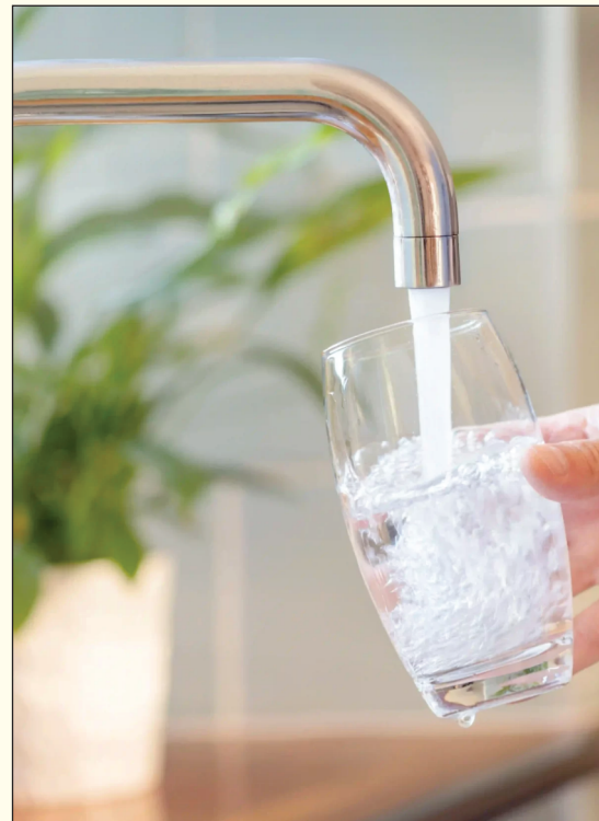
24x7 Water Supply