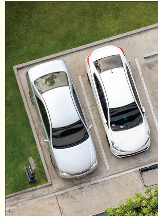
Ample Car Parking Space