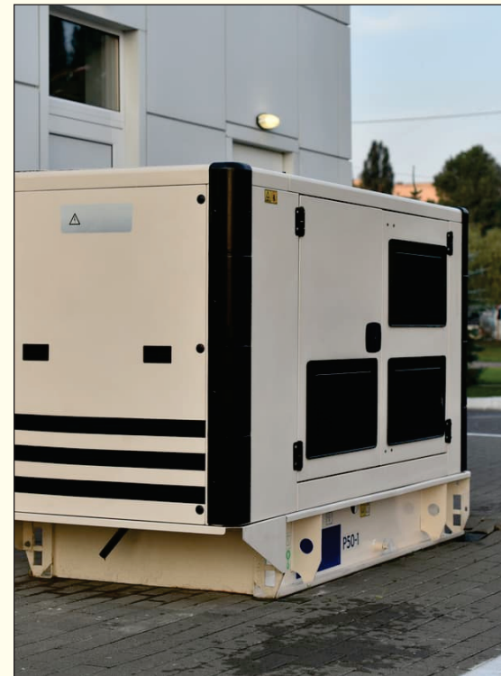
Power Backup For Common Areas