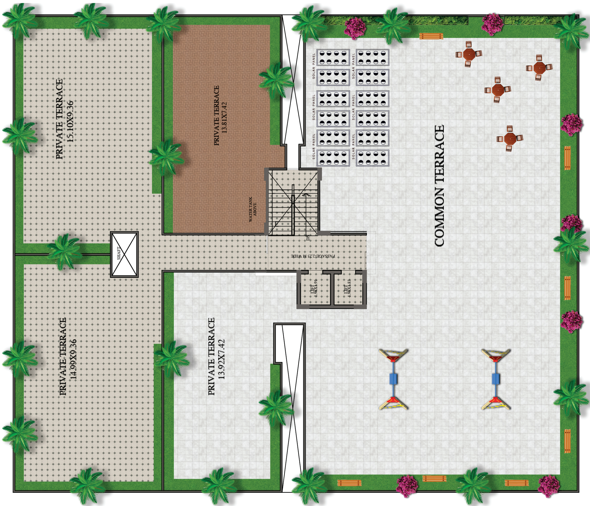
Terrace Floor Plan