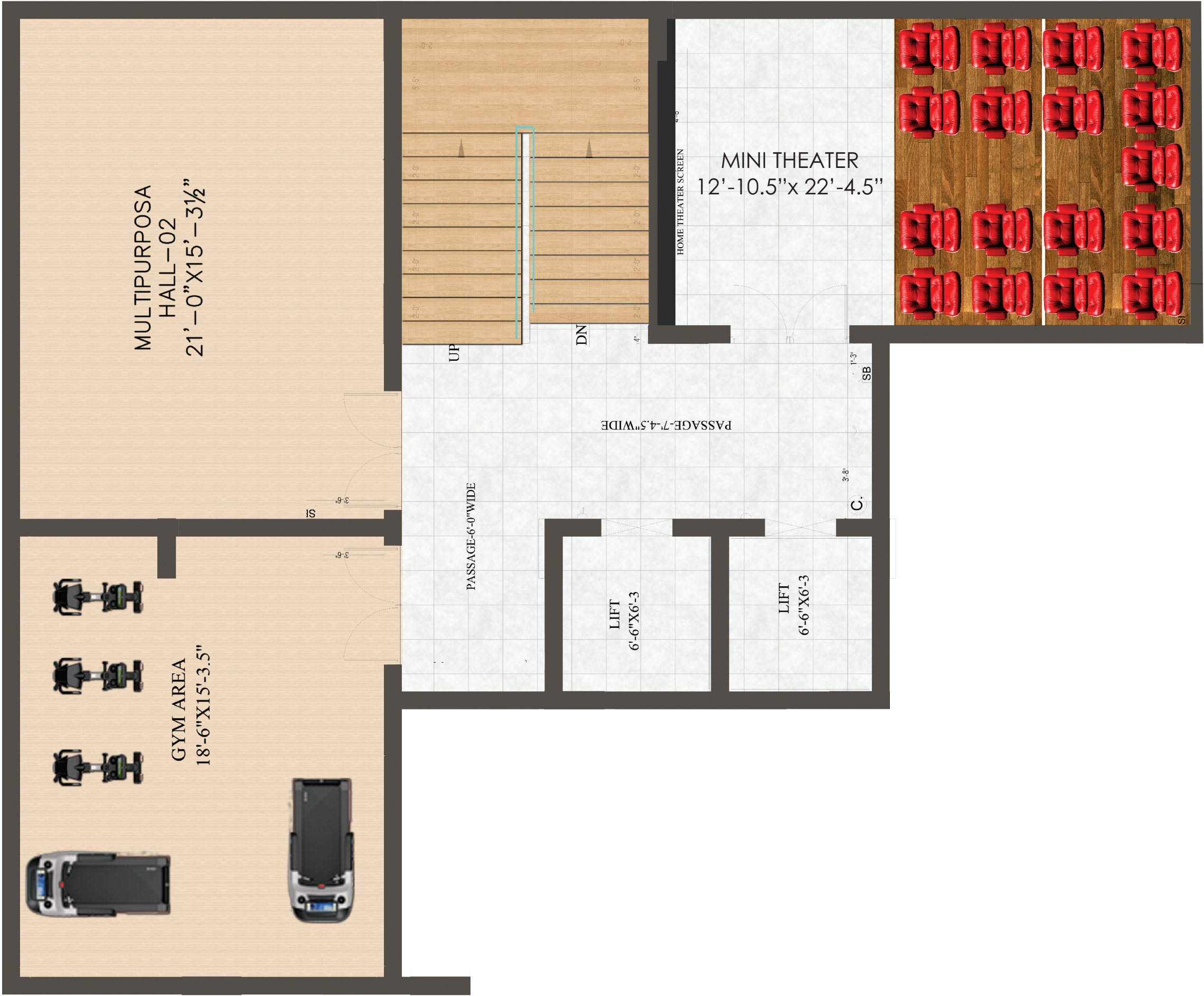
Basement Floor Plan